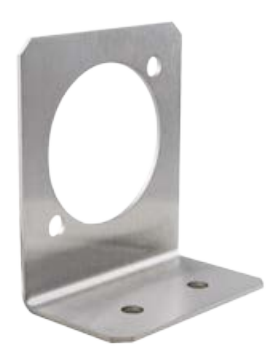
WALL MOUNTING BRACKET